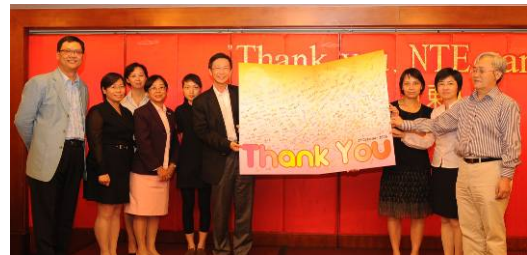
A time to share experience and views - NTEC Hosp Blog on MTMP