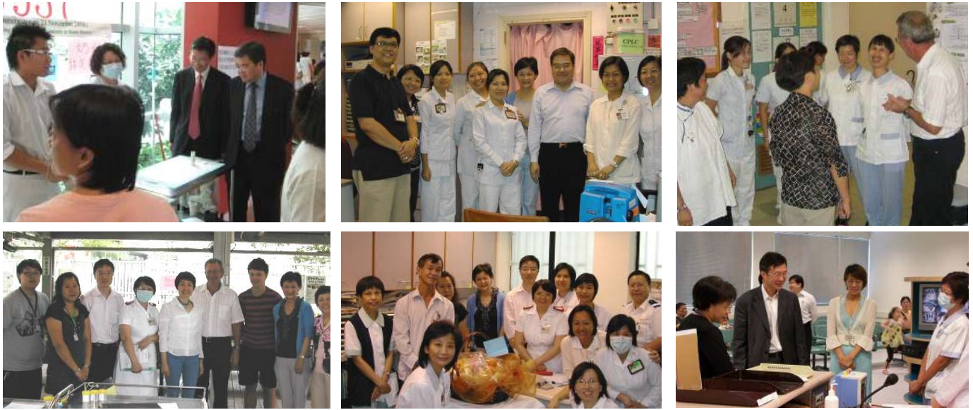
A time to thank the staff - a get together to celebrate a job well done